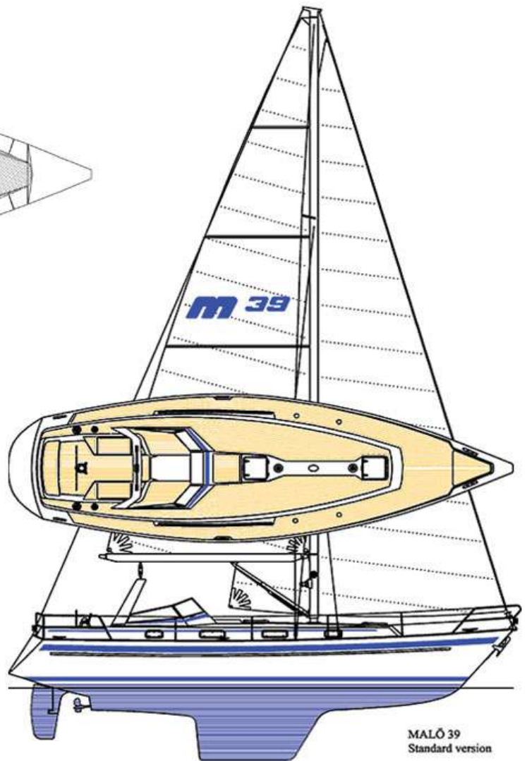
MALÖ 39 Standard version